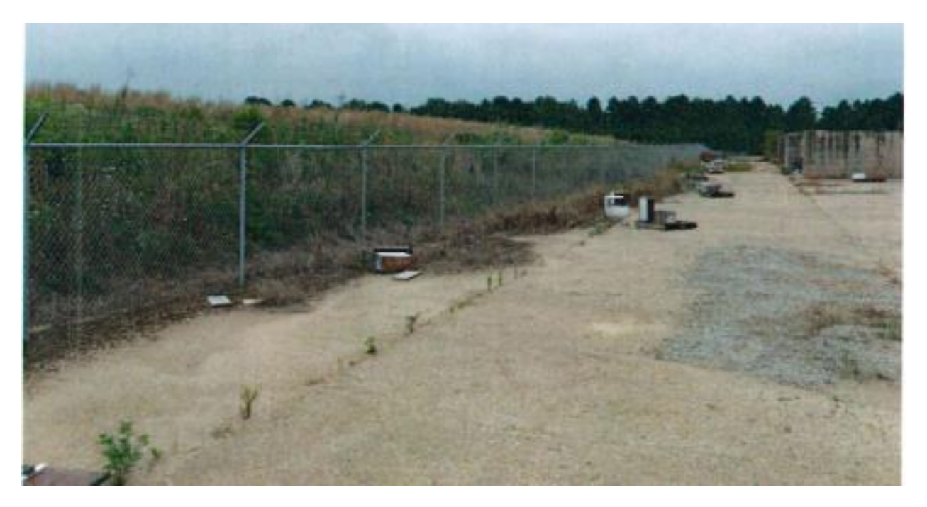
After: Site visit dated June 22, 2017. West fence-line next to Building No. 2.